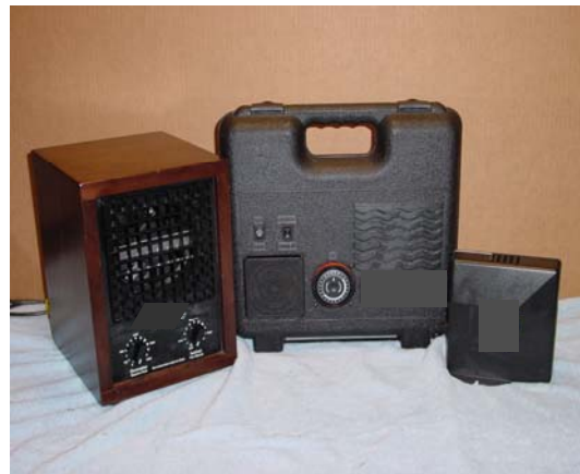
Common ozone generators

Some indoor "air purifiers" or air cleaners emit ozone, a major component of outdoor smog, either intentionally or as a by-product of their design. Those that intentionally emit ozone are often called "ozone generators," and are the focus of this fact sheet. Manufacturers sometimes inappropriately refer to ozone as "activated oxygen," "super oxygenated" or "energized oxygen," implying that ozone is a healthy kind of oxygen. Because ozone reacts with some other molecules, manufacturers claim that the ozone produced by these devices can purify the air and remove airborne particles, chemicals, mold, viruses, bacteria, and odors. However, ozone is not effective at cleaning the air except at extremely high, unsafe ozone levels, and then it is only partially effective.